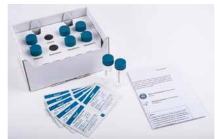
Validation & Cleaning kits