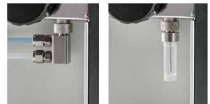
Online sampler / manual sampler